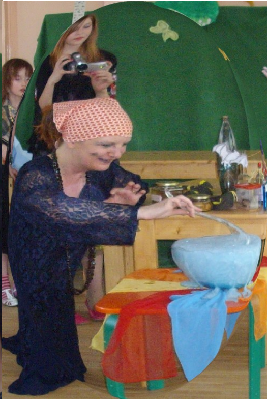
Potion to little witches...