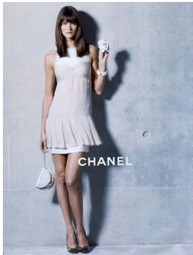
The face of Chanel, fall 2003. Photographed by Karl Lagerfeld.